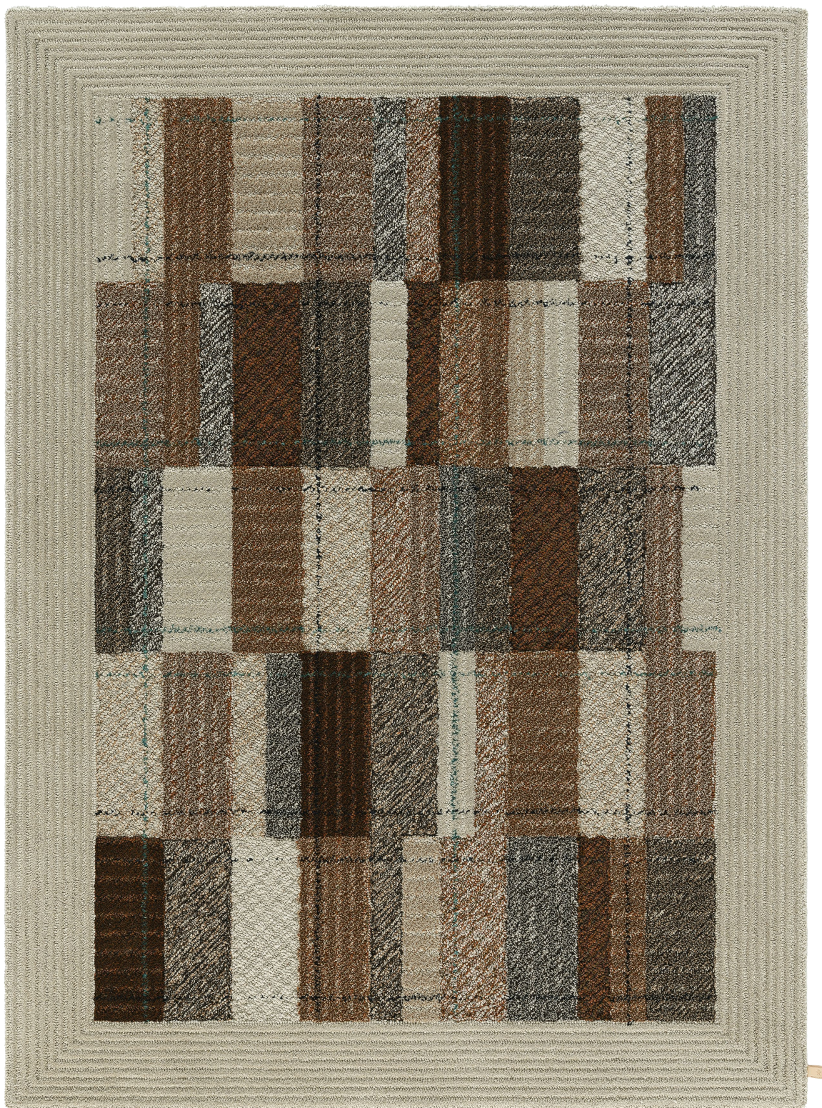
Rug, Terracotta Sand 870