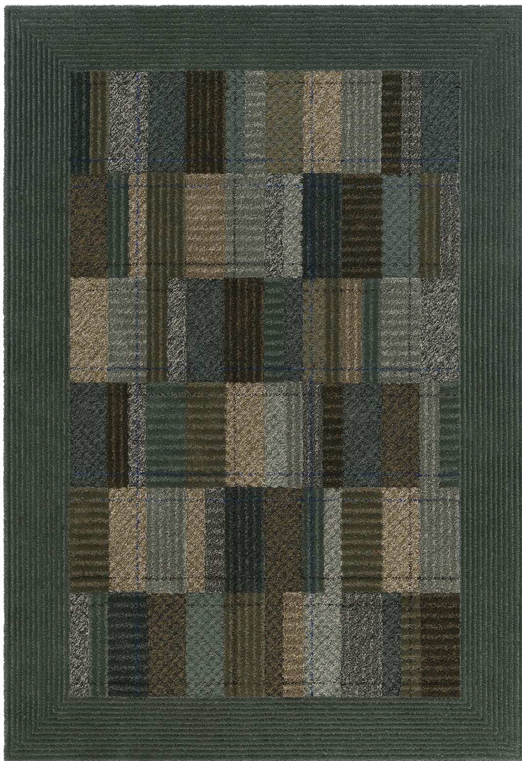
Rug, Bronze Green 370

Design ELLINOR ELIASSON Hand tufted cut and bouclé rug in pure wool and linen