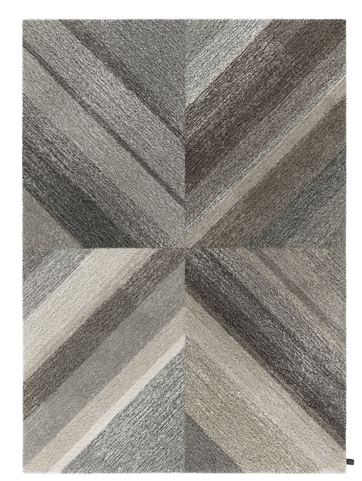
Rug 170x240 cm, Neutral 002