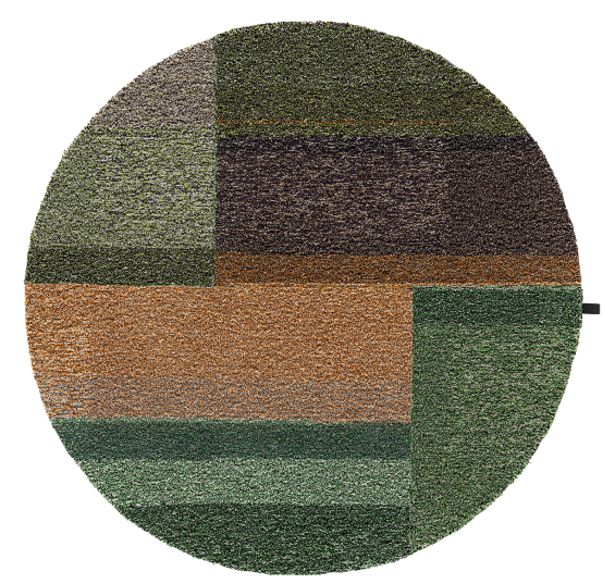
Rug 120 cm, Multi