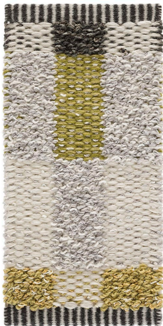
Frosty Plains 540

Design GUNILLA LAGERHEM ULLBERG Woven bouclé rug in pure wool and linen