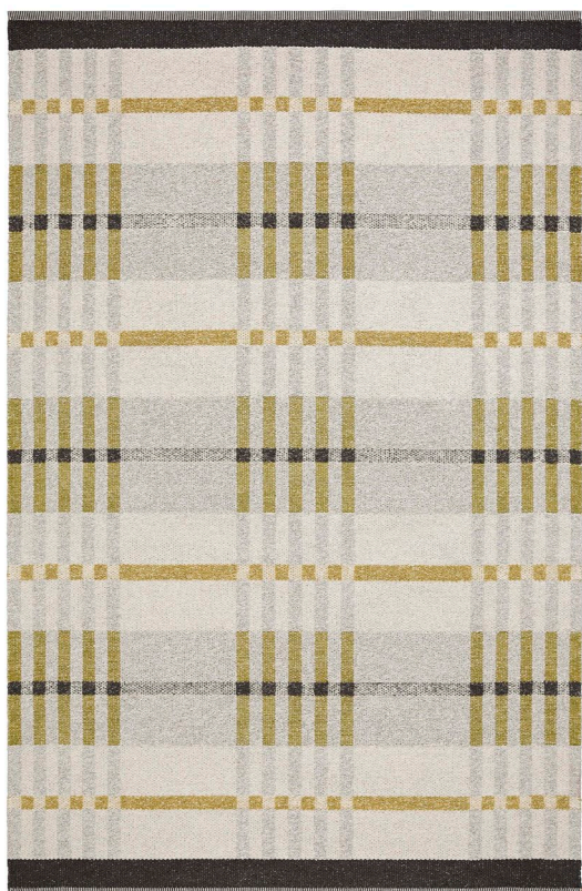
Rug 210x320 cm, Frosty Plains 540