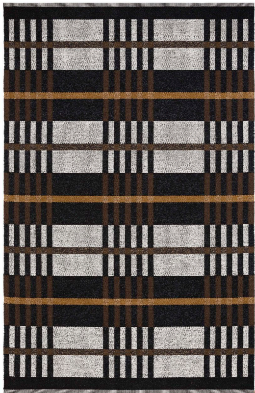
Rug 210x320 cm, First Snow 850

Design GUNILLA LAGERHEM ULLBERG Woven bouclé rug in pure wool and linen