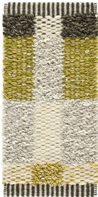
Yellow Rye 450