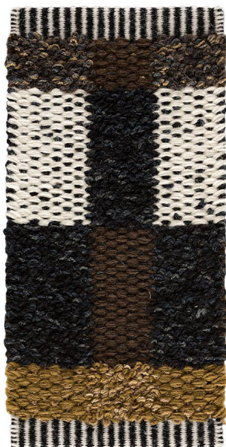
Potato Field 580