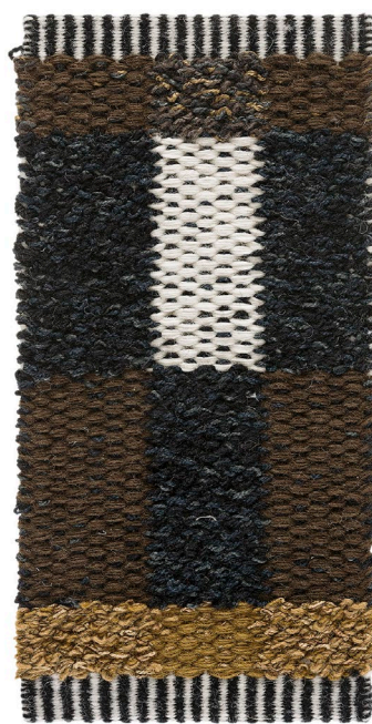
First Snow 850