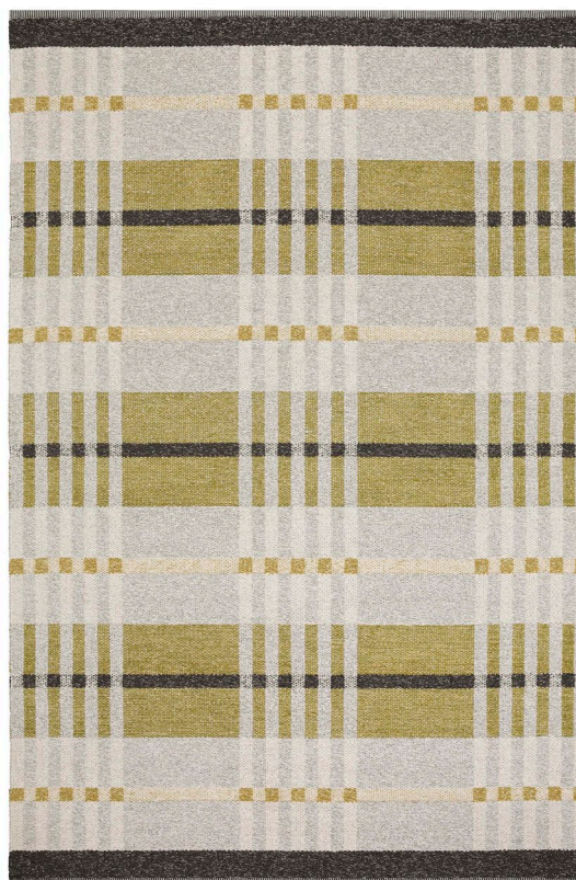
Rug 210x320 cm, Yellow Rye 450