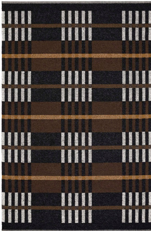
Rug 210x320 cm, Potato Field 580