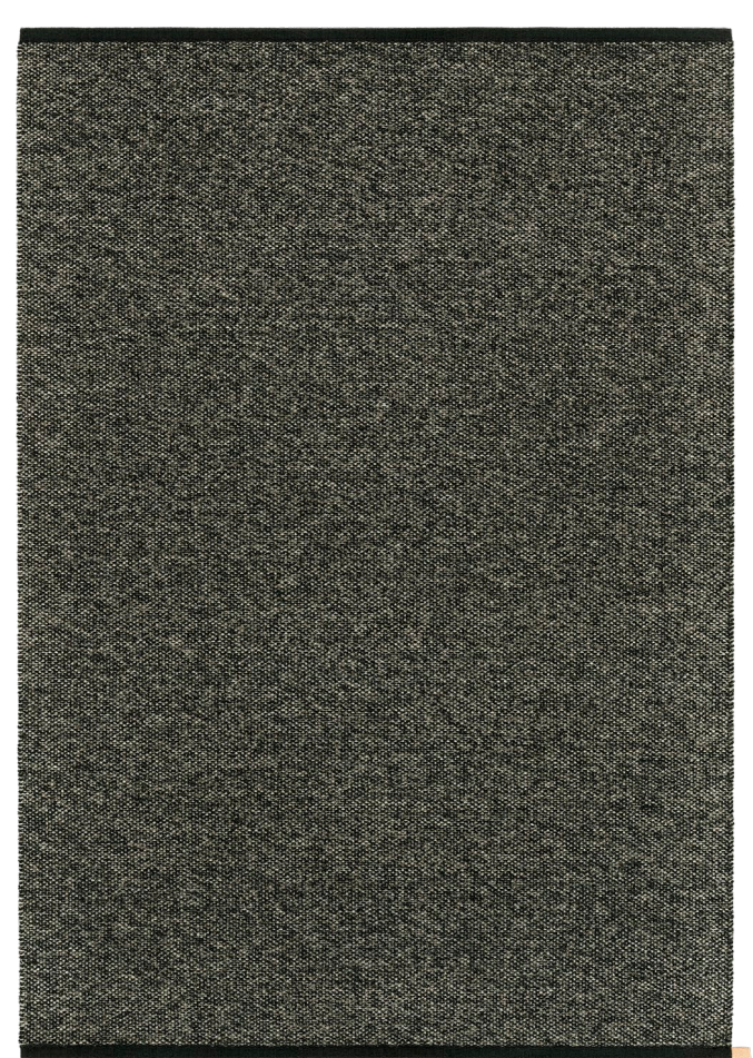
Rug 170x240 cm, Gabbro 703