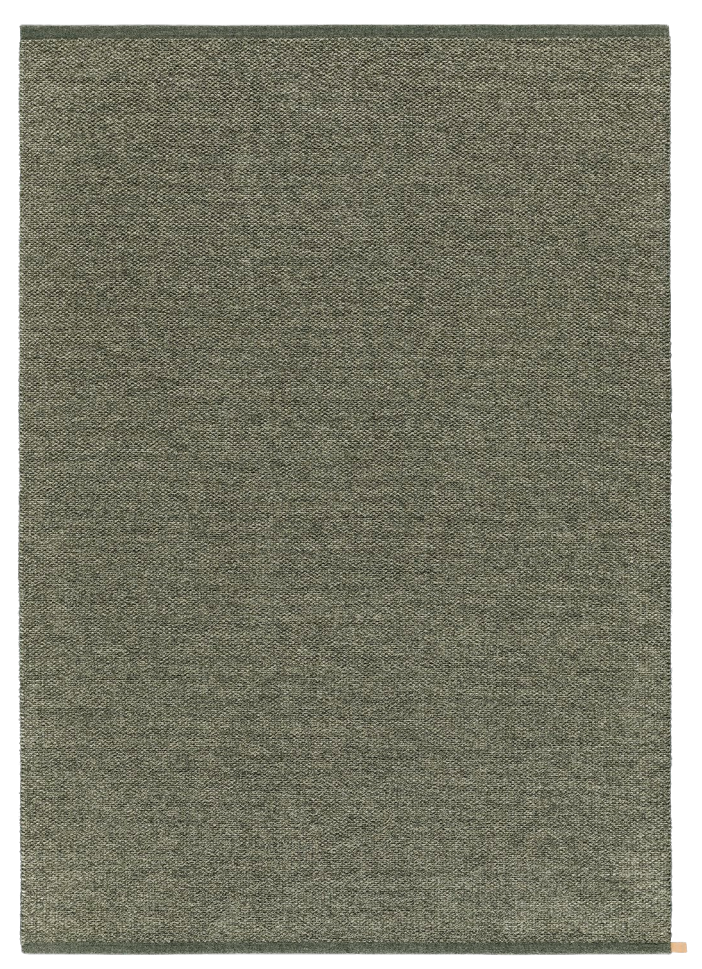
Rug 170x240 cm, Marcasite 504