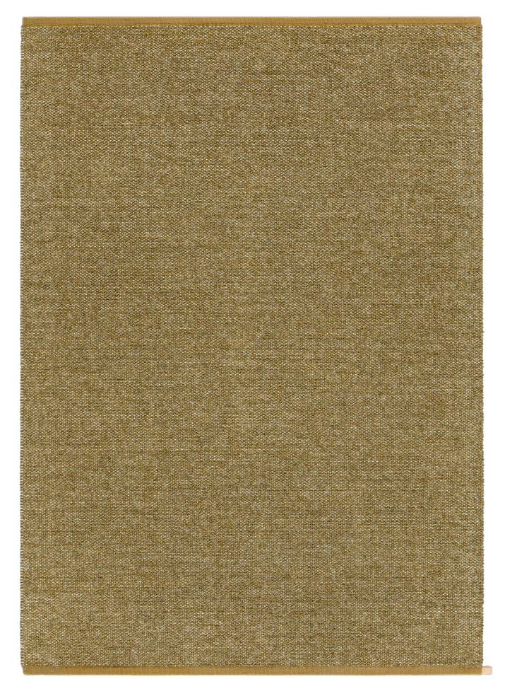
Rug 170x240 cm, Citrine 805