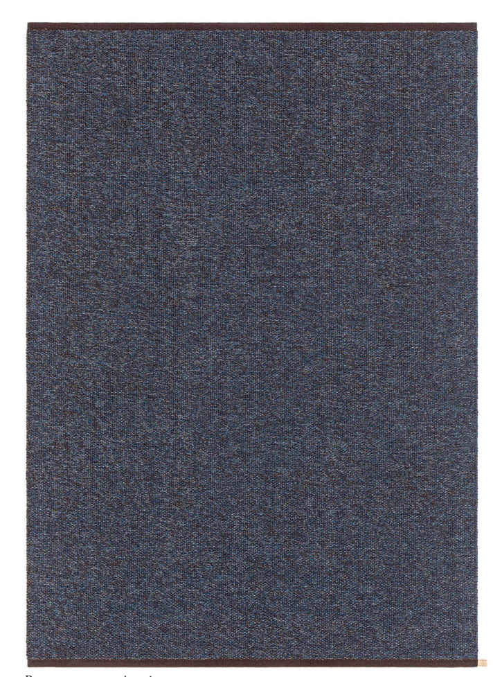
Rug 170x240 cm, Azurite 702