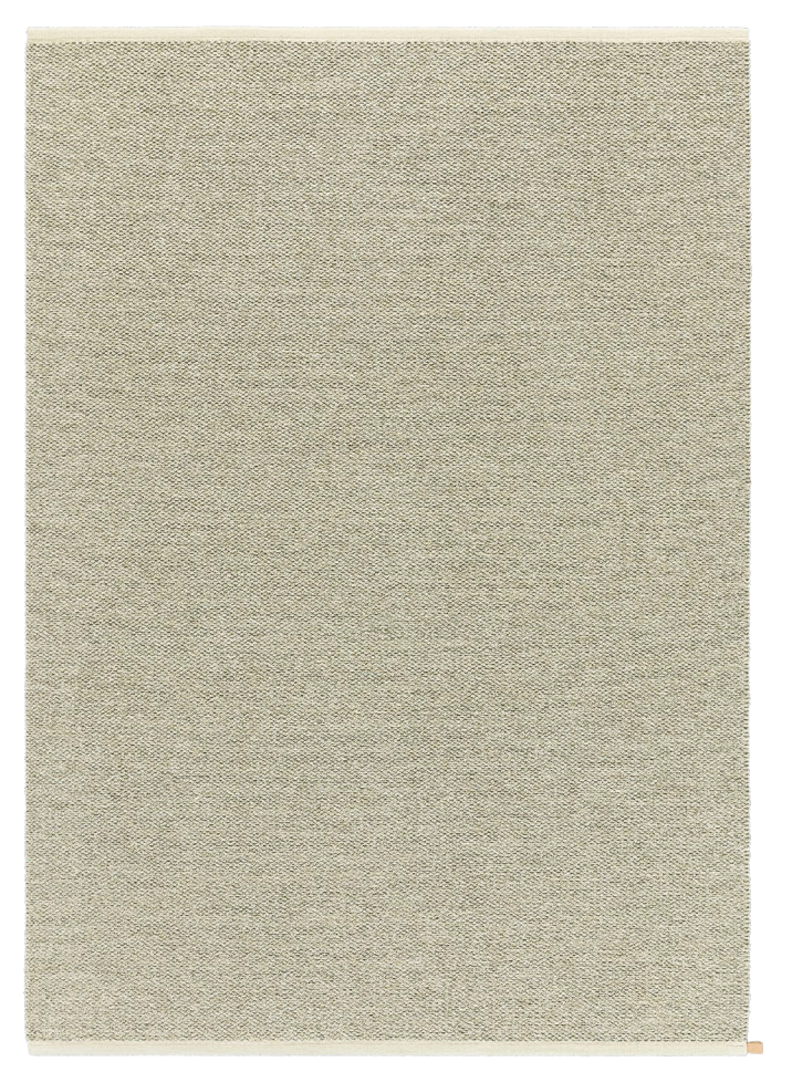
Rug 170x240 cm, Quartz 803