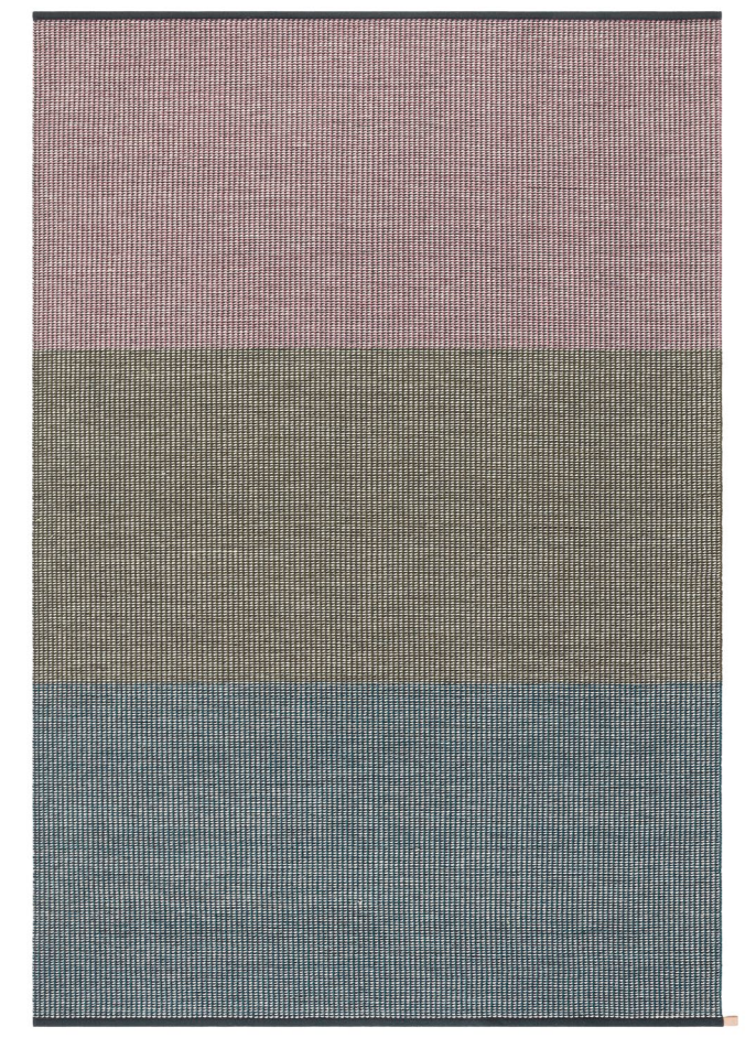
Rug 170x240 cm, Sound of Pink 620