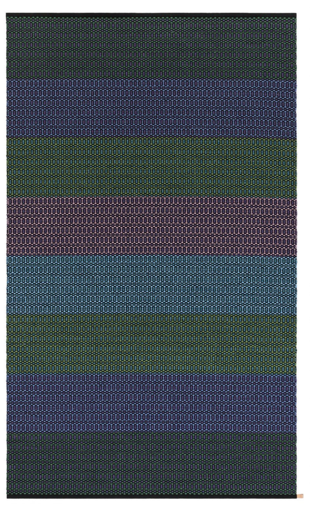
Rug 195x290 cm, Botanica 200