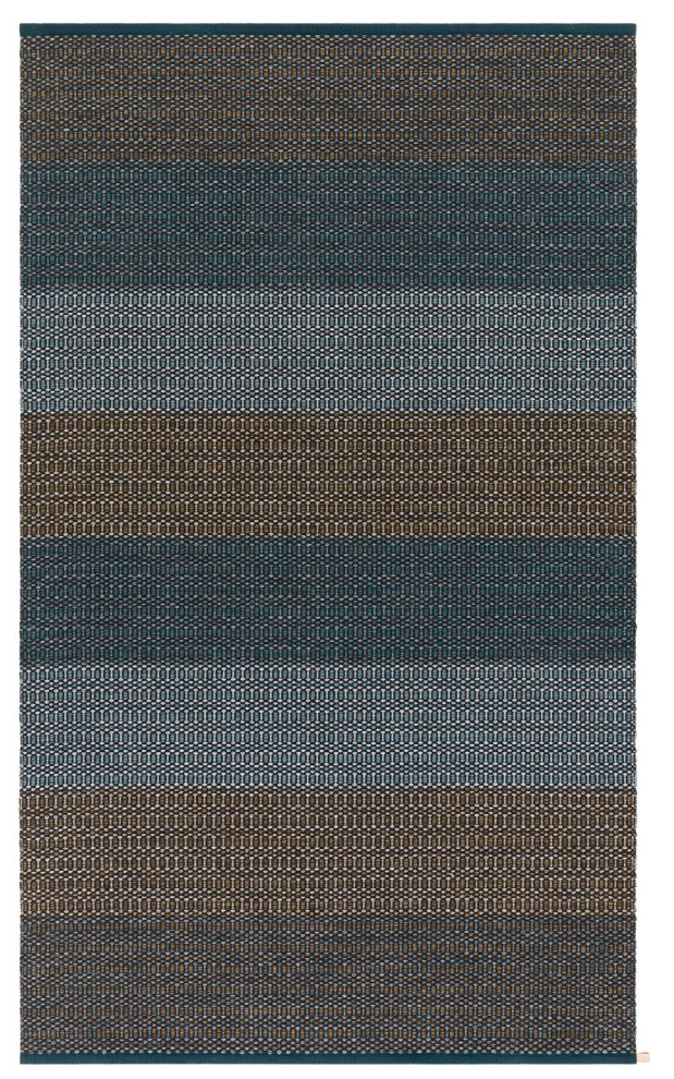
Rug 195x290 cm, Amber 801