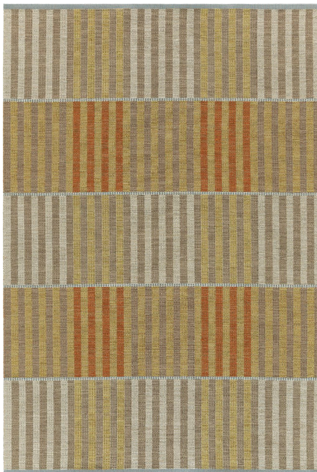
Rug 200x300 cm, Yellow 400