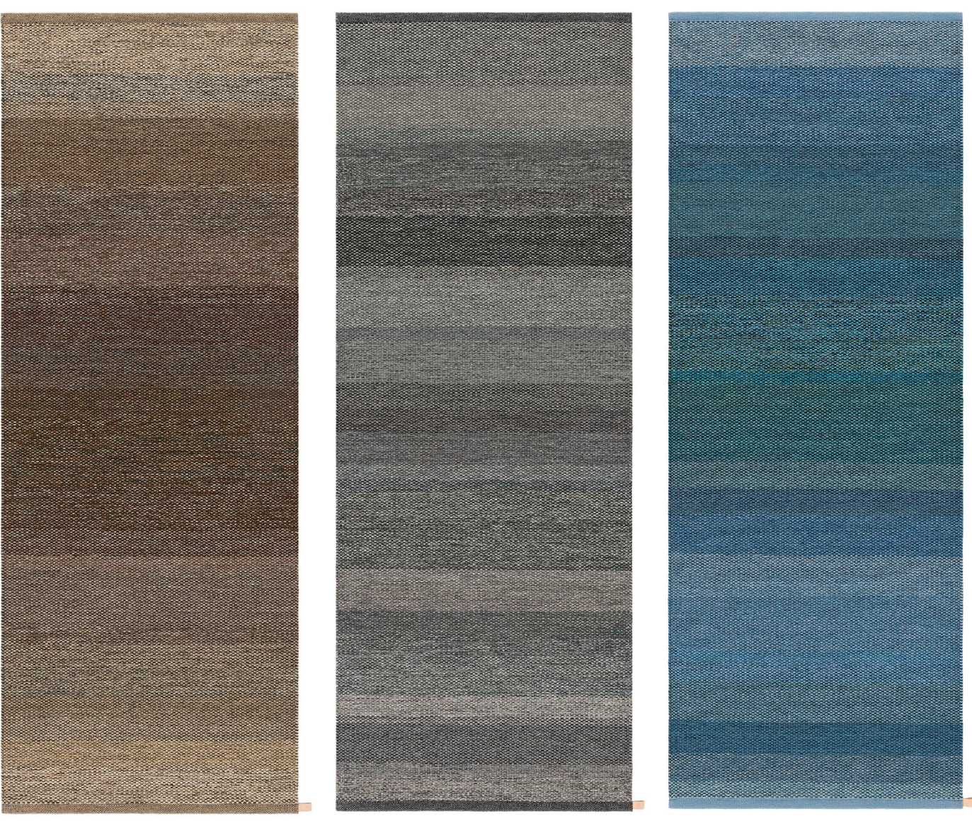
Rug 90x240 cm, Beige & Brown