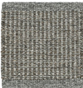
Silver Willow 551