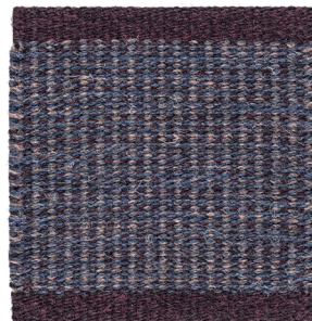
Dark Lavender 220