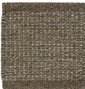
Pine Tree 880