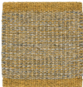
Golden Ash 450