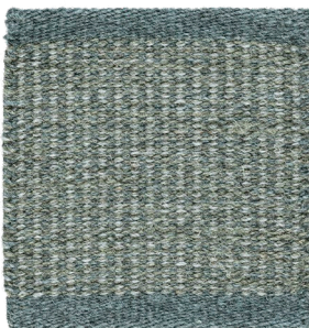
Ocean Mist 221