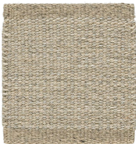
Sand Dune 882

Design ELLINOR ELIASSON Woven rug in pure wool