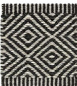
Goose Eye 909