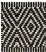
Goose Eye XL 949