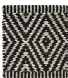
Goose Eye XL 949