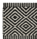
Goose Eye 909

These patterns cannot be combined with other patterns: