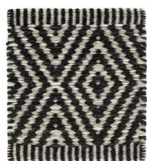
Goose Eye XL 949