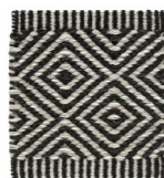
Goose Eye 909

These patterns cannot be combined with other patterns: