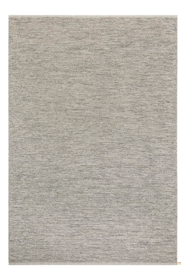
Rug 170x240 cm, Pebble Grey 502