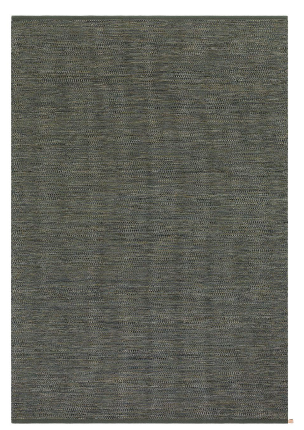
Rug 170x240 cm, Sage 301