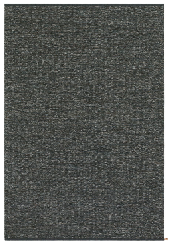
Rug 170x240 cm, Mountain Lake 202