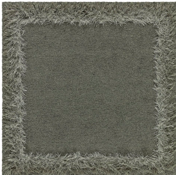
Rug 240x240 cm, Nandu 500