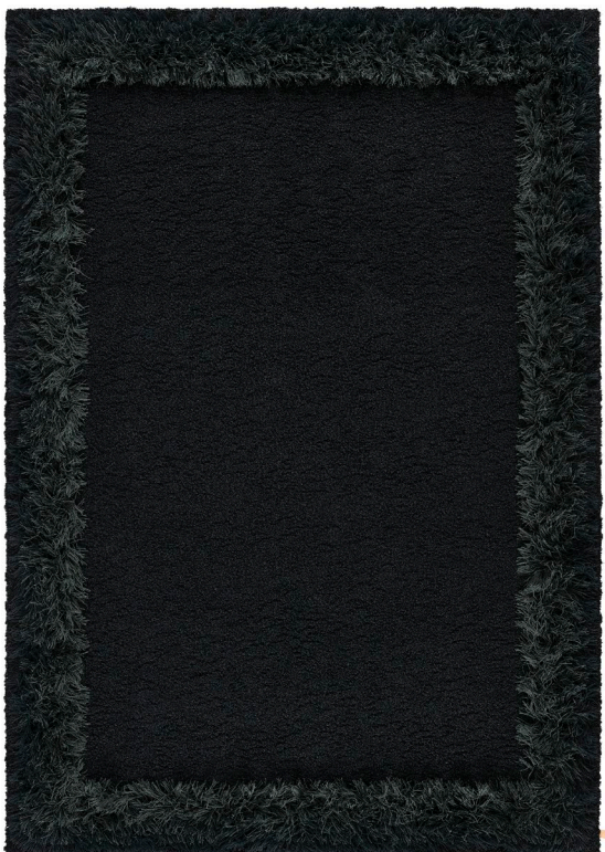
Rug 170x240 cm, Raven 502