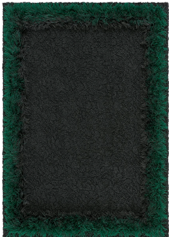
Rug 170x240 cm, Peacock 501