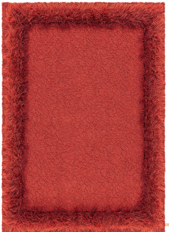
Rug 170x240 cm, Flamingo 100

Design ELLINOR ELIASSON Hand tufted bouclé rug in pure wool and linen