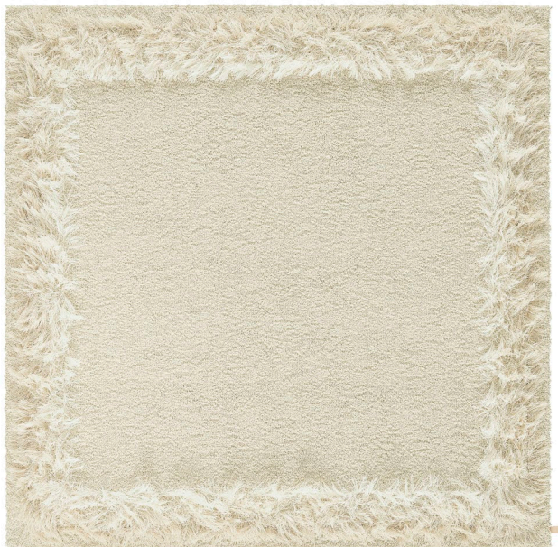
Rug 240x240 cm, Swan 801

Design ELLINOR ELIASSON Hand tufted bouclé rug in pure wool and linen