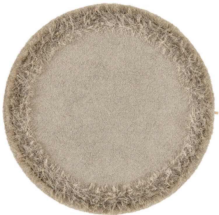
Rug round: Ø 240 cm, Heron 800