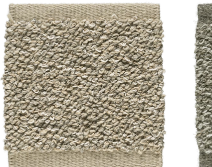
Limestone Sand 881