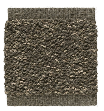
Smokey Brown 781