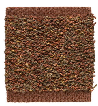
Deep Bronze 771