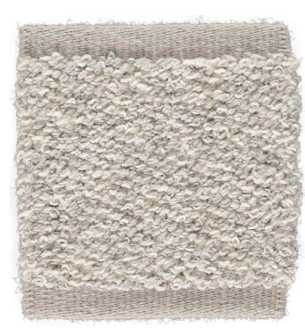
Soft Grey 850