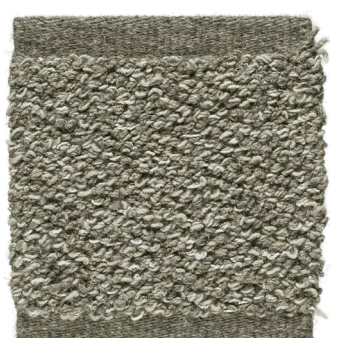
Antique Grey 581