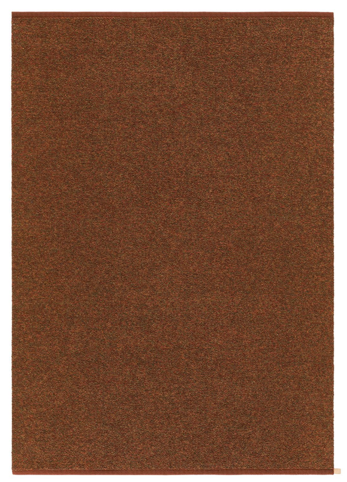
Rug 170x240 cm, Sun Light 442