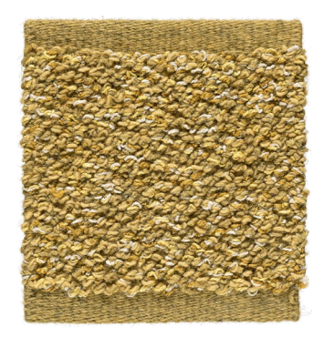
Sun Light 442