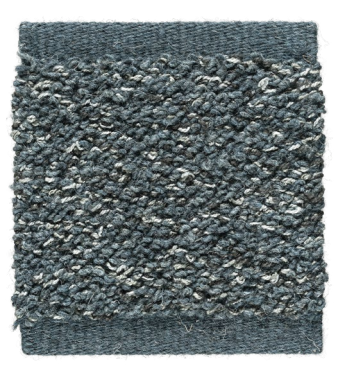
Skagen Blue 221