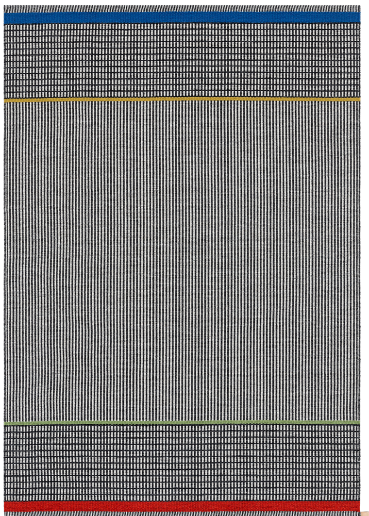
Rug 170x240 cm, Brochure rug