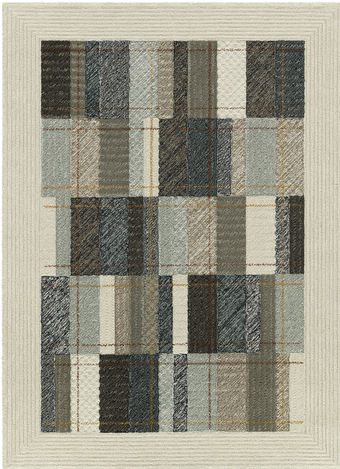
Rug 200x290 cm | Indigo Beige 820

Design ELLINOR ELIASSON Hand tufted cut and bouclé rug in pure wool and linen